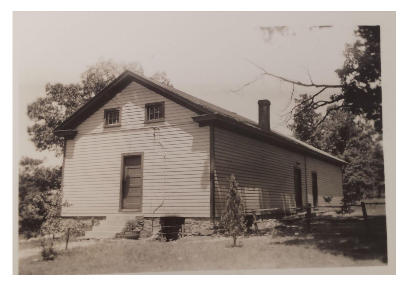
Figure 1 Willisville. Notice barred window at dirt level. This was the coal room.

Thank you for agreeing to help us document the location of the old school houses. This table of date should be helpful; but I also recommend that we meet. Larry Roeder roederaway@gmail.com. 703-8672056