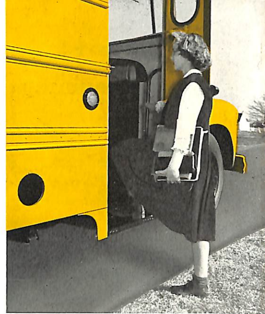
Students find the low entrance steps make it easier to enter and exit from the Hackney "FULLVIEW" School Bus. Note the handy grab bar. A convenient tool box is located under the entrance step.

New Style ! New Comfort ! New Safety Features ! New Values ! New Stamina ! New Materials !