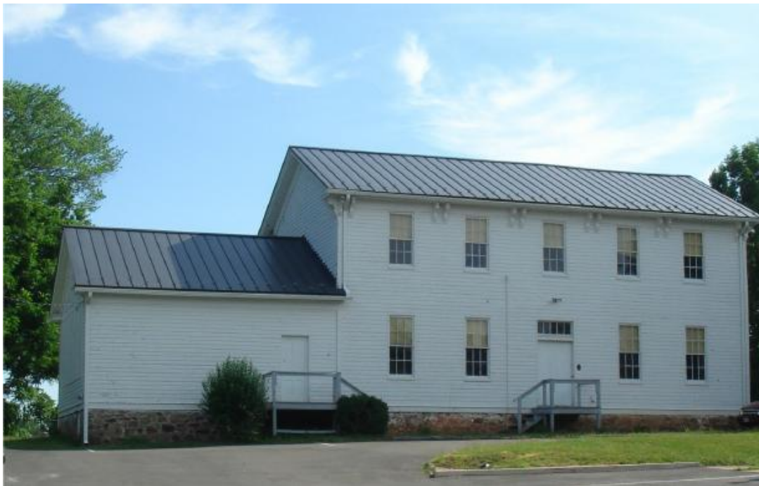
Figure 1 The second floor was reserved for high school education.